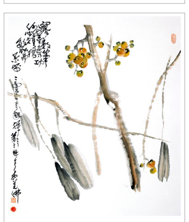
"Loquat," 2013, by HH Dorje Chang Buddha III. Carries the bell seal of Dorje Chang Buddha III and a three-dimensional finger print Gui Yuan. Lot 79. $9,000,000.