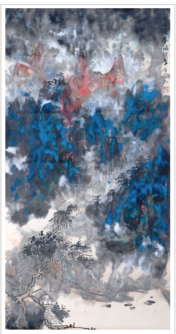
Mountains Springs", a 1984 painting by Liu Haisu. Lot 86. $8,000 - $15,000